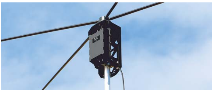
Barrett 4011 Antenna tuner shown as part of the Barrett 4017 Automatic tuning horizontal dipole antenna system. Barrett Communications part number BC401100

The 4011 is supplied complete with coaxial/control cable having an overall length of 6 metres (P/N 4019-00-02). The cable is a composite design incorporating coaxial, power supply and control cables.